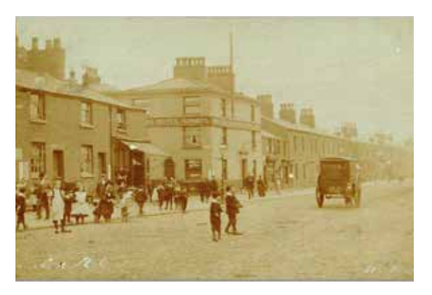
London Road, showing the Greyhound Inn, c.1905.

These are typical terraced houses, seen all across the region in industrial towns. It's difficult to work out exactly where number 4 was. It seems most likely that the houses were renumbered and it is now actually number 5.