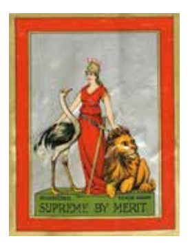
One of the Horrockses trademarks.