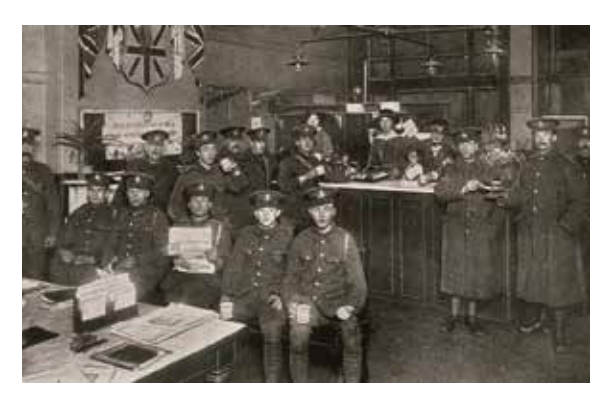
The interior of the Preston Sailors' and Soldiers' Free Buffet, 1916.

This is the room where the Free Buffet was located. By 1919 3 ¼ million soldiers and sailors had been guests of the buffet – men from all over the Empire. War worn and hungry, they arrived at the station and were supplied with refreshments day and night. Soldiers were offered blankets and pillows so they could sleep on wooden benches where a label was attached to them to alert the ladies of the time they needed to be woken.